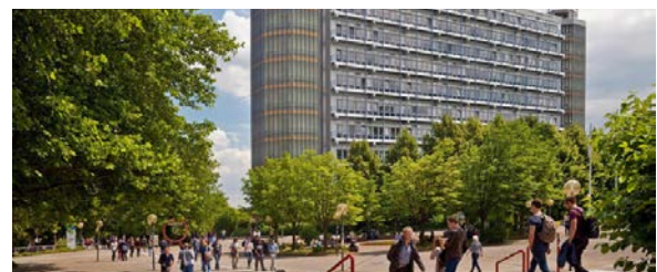
Dortmund Technical University (Dortmund, Germany)

A highly respected center of teaching excellence with outstanding facilities. Eaton has been a fire systems partner for over 15 years. A network of CF3000 panels can be found throughout the campus.