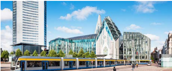
University of Leipzig (Leipzig, Germany)

Build a cohesive system that is connected and integrated, meets and exceeds safety standards, improving student and teacher productivity and security.