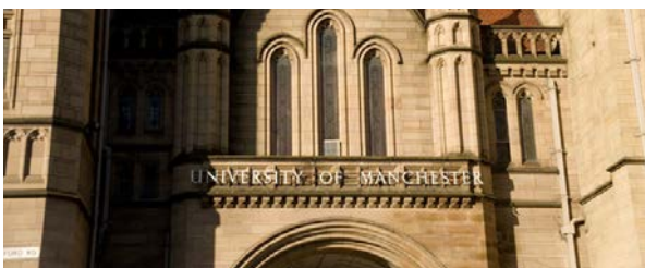
University of Manchester (Manchester, United Kingdom)

Eaton's emergency lighting products have been in use at Switzerland's largest University for nearly three decades. A wide range of central battery systems are installed across the University's 150 buildings. The campus also benefits from the CG Vision software monitoring system to maintain the large scale installation.