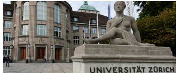
University of Zurich (Zurich, Switzerland)

The University of Leipzig was founded in 1409 and looks back on a long tradition. Today, the University has a brand-new campus benefiting from state-of-the-art equipment. More than 28,000 students from Germany and across the world have found a second home at the University. Eaton's centrally powered emergency lighting is installed at the site.